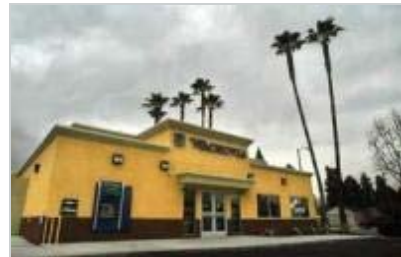
Wachovia's new eco-friendly facility at 5625 Woodruff Ave. in Lakewood. It is becoming easier for businesses to go green, as many environmentally friendly products and materials cost the same as other items have in the past.